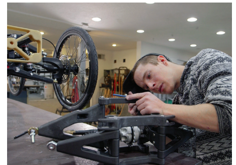
The ability to use Stratasys FDM Nylon 12CF in all stages of the manufacturing process is a game-changer for Utah Trikes.