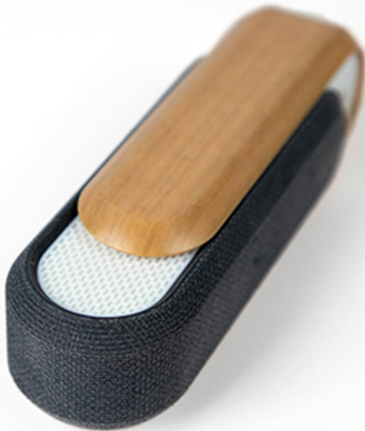
Speaker prototype 3D printed on the J55 Prime