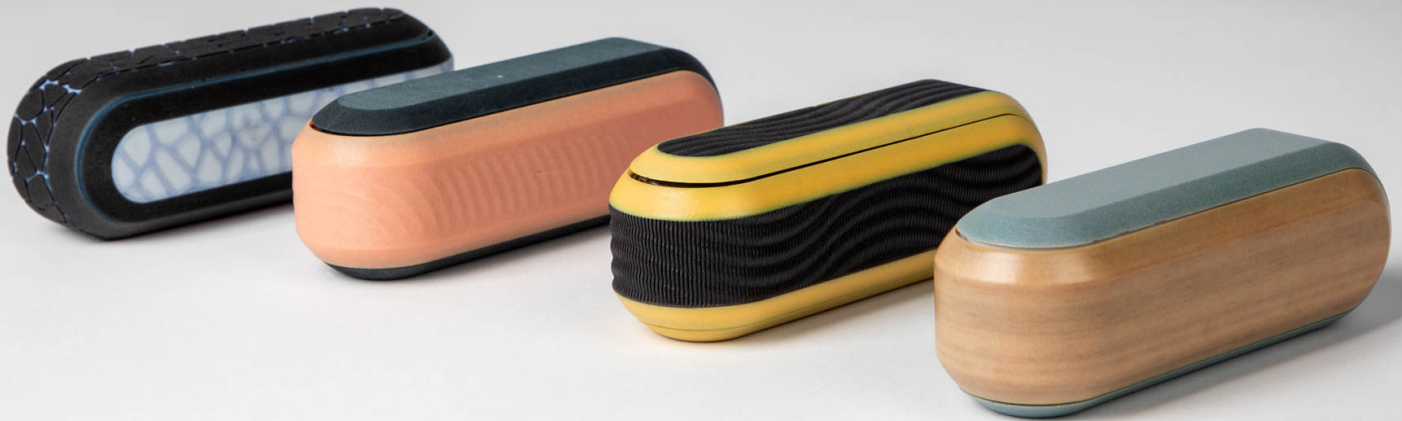
Early CMF explorations 3D printed on the J55 Prime

This workflow has major implications for how the team will approach future projects. Priority Designs uses KeyShot throughout the product design process – it offers a large material library and the renders help communicate ideas to clients. The ability to go from KeyShot render to 3D print with few steps in between saves time and makes it easier to create physical prototypes.