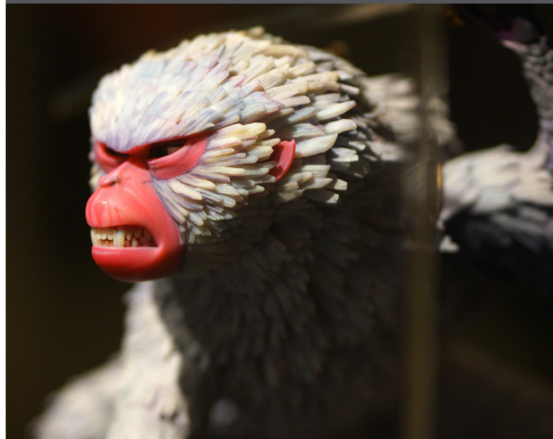
Monkey from "Kubo and the Two Strings," LAIKA's fourth feature film.