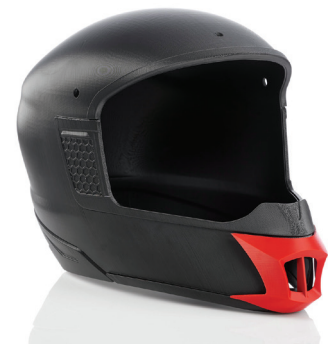
The helmet prototype was 3D printed in one build on the Stratasys F370.