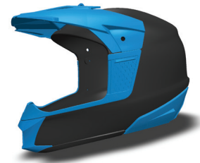
Render of CAD's helmet redesign highlighting a new camera mount, back piece and mouthpiece in blue.