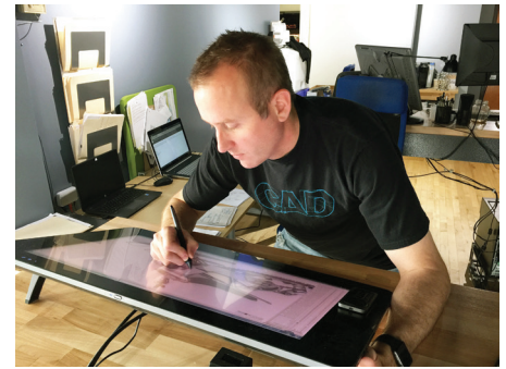
CAD specializes in creating complex surface geometry for the plastics industry.

Features of the Stratasys F370 like its minimal setup, fast-draft mode and auto-calibration ensures less time troubleshooting and more time for the team to tackle the next complex design.